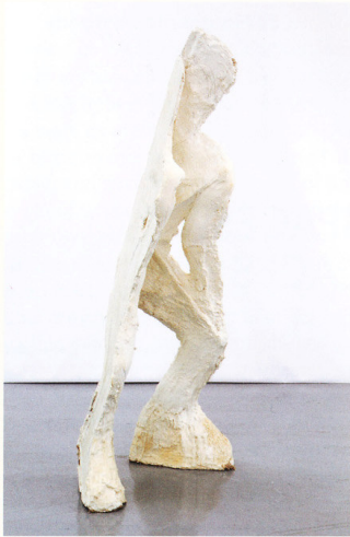
Folded Man, 1997, plaster, jute, inox, 220 x 110 x 80 cm

— As the realities of space and time have unfortunately not allowed for a face to face meeting, I can't help wondering whether you feel that you still correspond to Rudi Fuchs's description of you as: 'young, red-haired, intense and impatient – a Yorkshire boy'? Pretty much. Yes. I'm still red-haired, impatient, a little less intense, I think, and for sure less young. 'You can take the boy out of Yorkshire, but not Yorkshire out of the boy.'